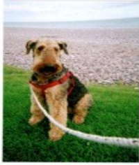
Butter wouldn’t melt in my mouth

He, in spite of these small failings (nobody’s perfect) is a wonderful loyal and loving dog. How his previous three owners could bear to part with him I don’t know. He is definitely their loss and our gain.