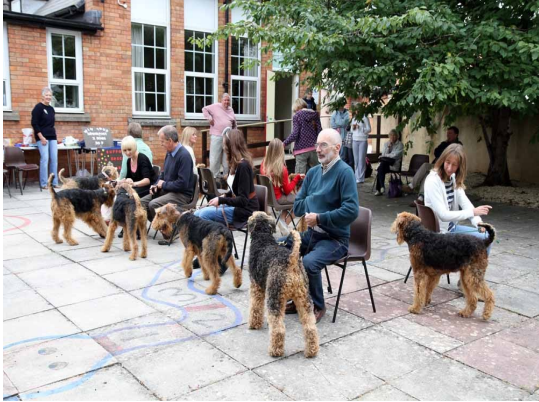
I hope it's Jools Holland on the piano!!!