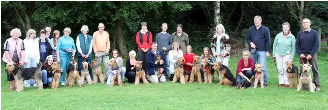
The Full Cast of the Fun Day