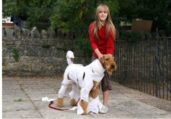
Who said Andrex is for Labradors only!!!