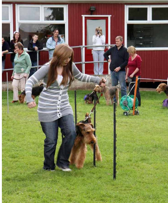
Watch my back legs please - ouch!!!