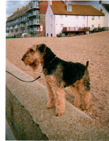
Where’s the Postman or the paperboy